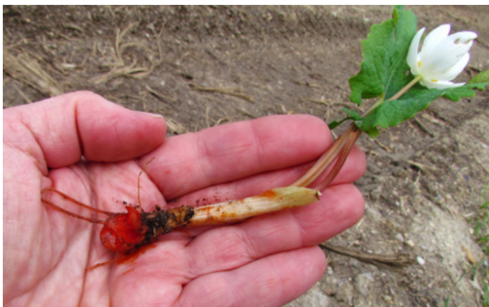
Sanguinaria canadensis w/ exposed roots

So when you go out hiking in the woods this spring, keep an eye out for the bright white petals and interesting leaves of the bloodroot flower - a sure sign of warmer weather on the way!