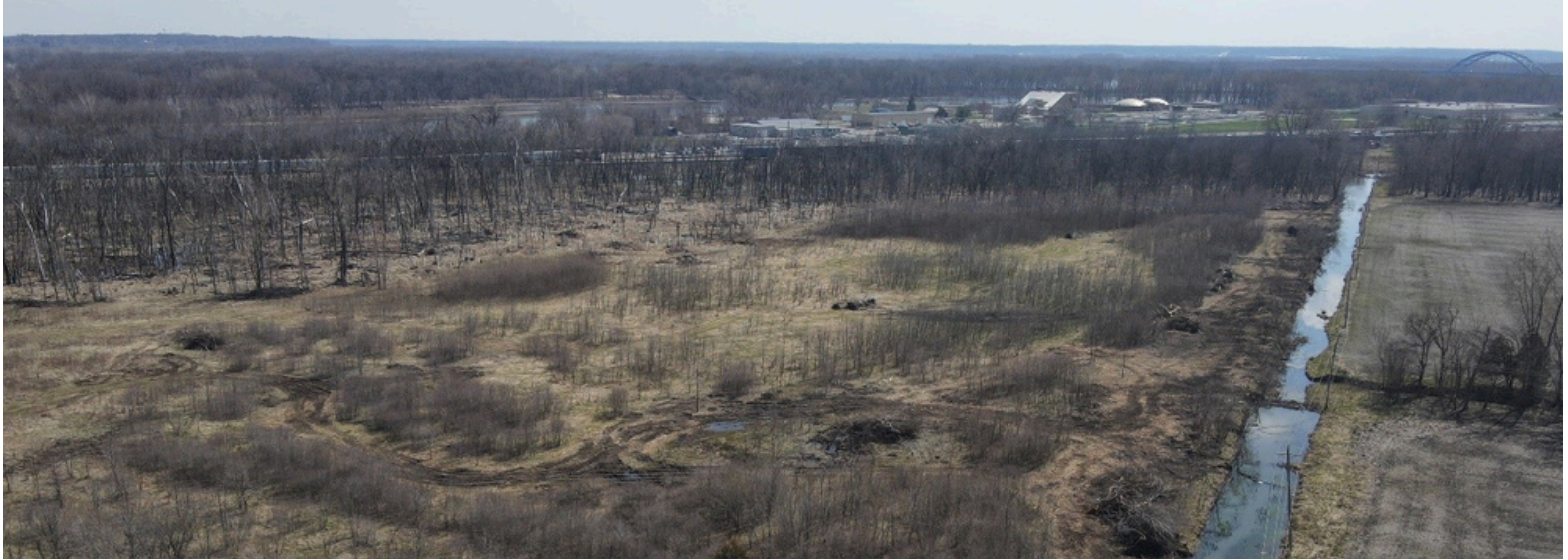
Aerial view of the stream mitigation bank site - 3/28/24

Spring has arrived and the busy season is just around the corner for our natural resources crew. So far, the Mississippi River flood forecast is looking favorable for us with below normal risk of flooding. We will be spending much of this year removing invasive species, planting a new pollinator garden, updating trails, and monitoring water quality, tree growth, and biodiversity at the marsh.