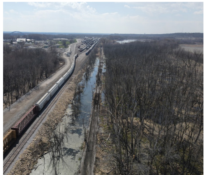
East Trail Location

Work will also be complete soon on Phase II of our trail improvement projects. This mile-long section of trail will allow visitors and staff to connect to the northeast end of the preserve and features a paved portion for better accessibility. It will also allow for a future trail that will lead to Nahant's newest properties.