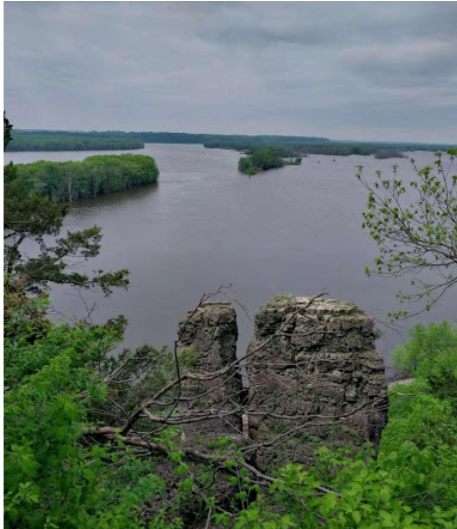
2022 Trip Photo