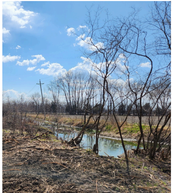
Tree removal along existing drainage ditch to prepare for the construction of a stream through the site - 3/28/24

An exciting restoration update: the stream mitigation bank work has begun! This 15-acre parcel is currently an overgrown degraded field with a drainage ditch bordering the edge. The drainage ditch will be converted into a meandering stream, with sedge meadow/prairie on both sides. Historically, Walnut Creek flowed through this area before it was diverted and channelized. This restoration project will allow for water to enter the marsh more slowly and allow for it to filter naturally before making its way into the main marsh. Nahant Marsh is contracting out the construction work but will be responsible for management and monitoring once the project is complete.