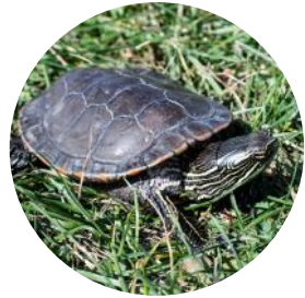
Buddy Painted Turtle Cassie Druhl