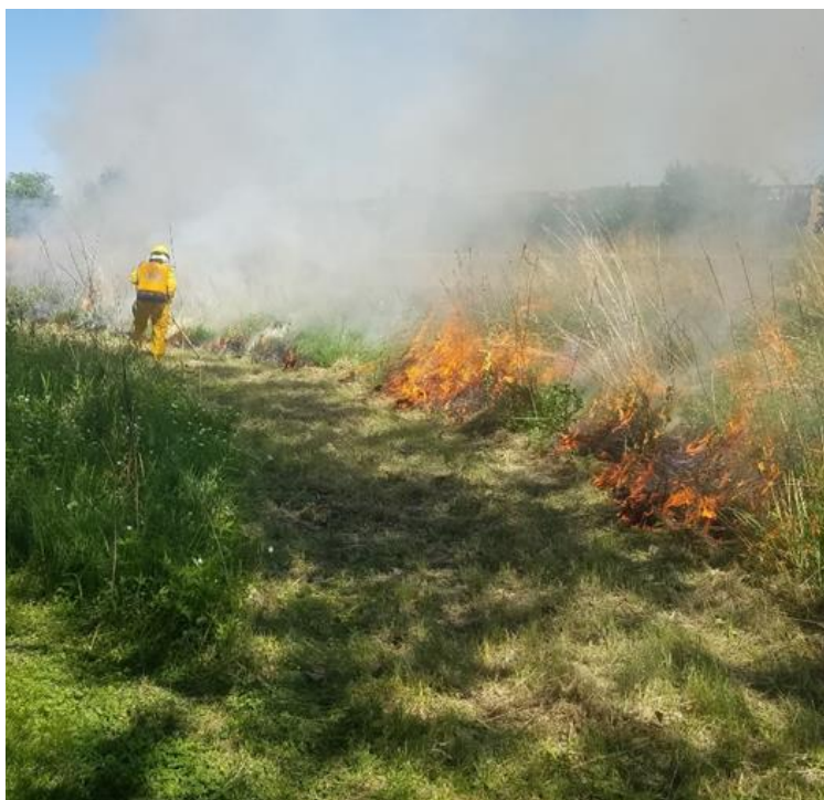
Prescribed burn in progress on 5-26-2021. Natural Resources are managing grasses in the prairie and working to add more forb diversity in future years.